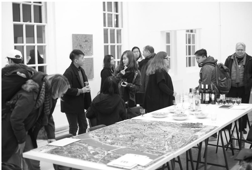
Fig. 1. Private view for The Millbank Atlas exhibition at the Cookhouse Gallery, Chelsea College of Arts (2017)

The Millbank Atlas is a collaborative project that brings together researchers, students and local residents to trace the neighbourhood of Chelsea College of Arts. The Atlas creates meaning through conceptualising Millbank as comprised of reciprocal relations among the college and surrounding businesses, residential blocks, civil society groups, transportation links and other amenities, infrastructure and further aspects of this built and natural environment.