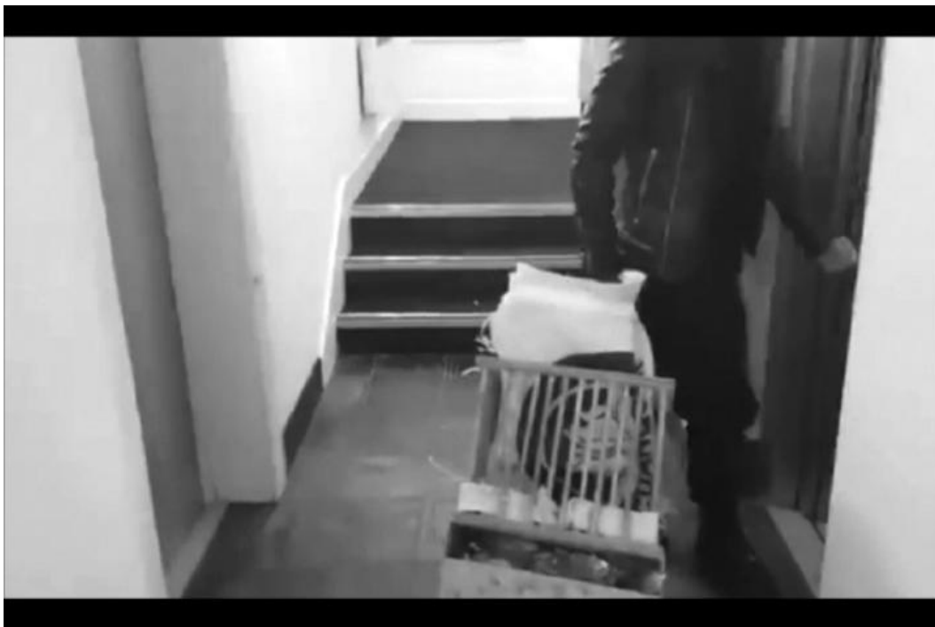
Fig. 2. 'Chelsea Local' student testing a food trolley prototype, Millbank Estate (2017)