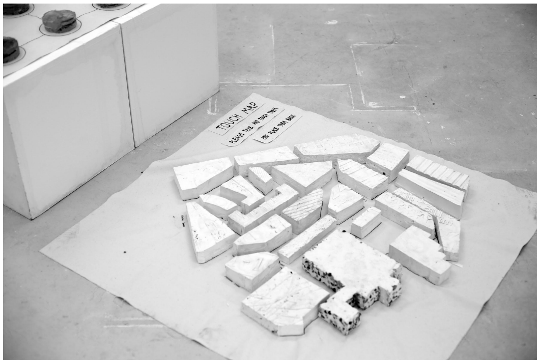
Fig. 3. Touch and Sense Map Part I , Evans Ye, The Millbank Atlas exhibition at the Cookhouse Gallery, Chelsea College of Arts (2017)

The second strand of student work in the exhibition of the Atlas included maps of Millbank that were crafted by individual students to explore a specific subject. These ranged from local crime patterns and pollution patterns, green spaces, changes in use, smells, sounds and other themes. Once the students received their assignments, we encouraged them to 'take their subject for a walk', to hit the streets of Millbank, immerse the bodies and minds in the local environment, fully participate in the urban landscape—pay attention to their lived experience of London.