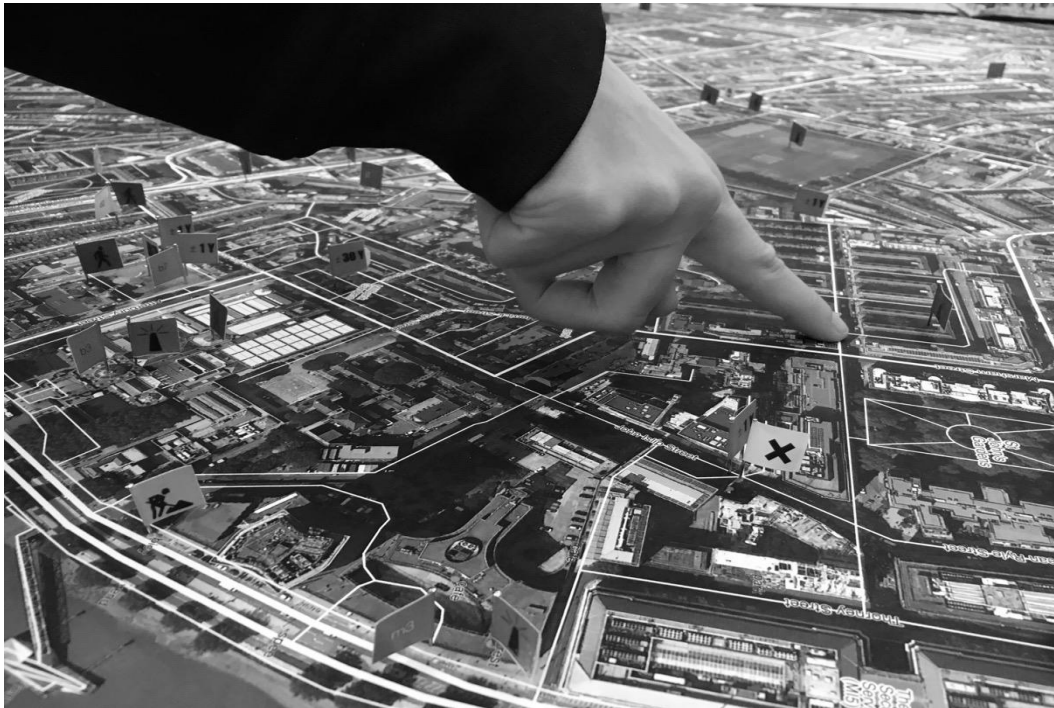
Fig. 7. Collaborative mapping workshop in The Millbank Atlas Exhibition at the Cookhouse Gallery, Chelsea College of Arts (2017). For more information about the public programme that animated the exhibition, see Bradfield, Shechter, Rimensberger et al., 2017