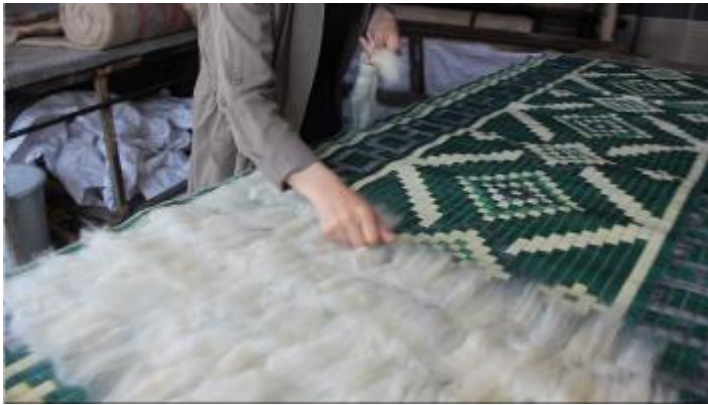
Figure 5: Preparing the wool layers before felting. The small lumps are placed on top of each other. Maker: Şeyma from the studio. Photography: Author, August, 2017.

movement. (Working Diary, 16. August. 2017)