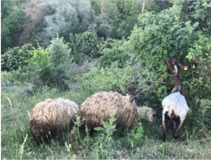
Figure 2: The sheep while eating. Their wool has not been cut since previous spring. Photography: Author, July, 2017. Turkey.

breeding. Sheep and their woolfell at their natural habitat was photographed and video recorded (Figure 2). When still on the sheep, the wool creates its own movements and shapes, influenced by every act of the sheep. The naturally occurred forms are unique and proposes infinite numbers of compositions as they happen by chance.