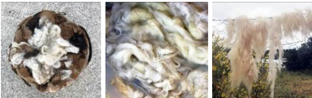
Figure 3: Wool from different phases: left: wool squeezed in a bag, middle: wool under water, right: wool after being cleaned and hung. Photography: Author, July, 2017. Turkey.

I also collected the unwanted wool, that is cut from the sheep by the owner. When wool faces with any kind of pressure, high or low, it changes its own form, for example if it is kept in a bag, the wool will be squeezed in the form of the bag (Figure 3). The wool was cleaned and roved with hand operated tools in order to examine its nature (Figure 3, 4). Roving is a way of brushing the wool: the lumps of wool are passed through the metal needles that are located on a flat surface. Then each hand pulls the wool to opposite directions so that wool fibres are lined up.