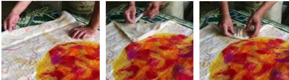
Figure 7: Working on the corners. The sharp edge look is curved by manipulating the flexibility of half-felting wool. Maker: Zekeriya from the studio. Photography: Author, August, 2017.

When designing and preparing process is completed, the pieces are processed at the machine for several times, each results in fifteen to thirty minutes depending on the thickness of the piece. After the first time at the machine, the wool is still not a compound surface but partially felted where it is still open for re-forming. The flexibility of the material allows maker to make changes in the form (Figure 7). By picking the wool and un-felting it, the form of the piece can be still manipulated. For example, in this case, when the piece with the sun was partially felted, the corners were curved.