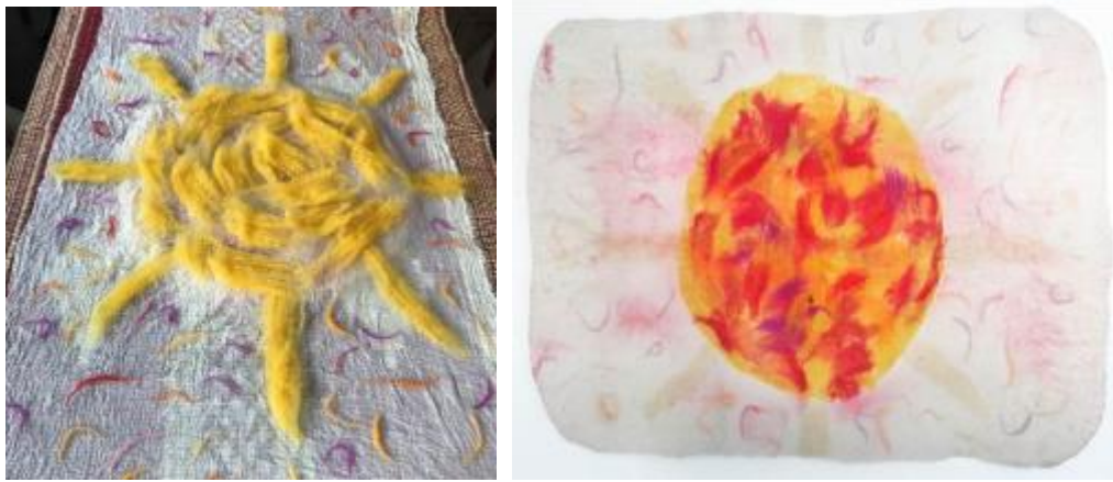
Figure 6: Making of the felt piece with the sun pattern and the final appearance. Background pattern is created by following the movements of the material. Maker: Author. Photography: Author, August, 2017.

After he mentioned making the sun two days in a row, in the third day, I decided to apply the sun as a pattern in my design. I made only the sun, not the whole landscape, because he emphasised the sun and I was just in need of an idea to begin practising for the sake of experiencing the material. Accordingly, the design was not the focus of making but it was just a trigger. In the morning, on the way from my hotel room to the studio, I thought about how to design the composition: I wanted to have only the sun in the centre and I could use all the colours that are in the sun rise and set, since many colour options were available at the studio. When I started making, one decision led to another with the guidance of the material (Figure 6). While making, the wool pieces fell on the surface in their natural shapes, and I decided to have the form of those curves as background pattern in the both sides of the sun. I noted to my working diary: