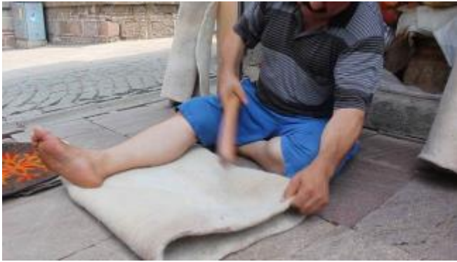
Figure 8: The master re-forms the shape of the felted wool, with the help of his stick, after the first iteration of the machine pressure. Maker: İlyas from the studio. Photography: Author, August, 2017.

The experiences from both studies have revealed that in each step of making, wool has a compelling existence, in hidden ways. The final form of the piece is not always the desired one but a result of the negotiations with the material. In a way, the pieces are co-designed by the human-maker and the material-maker.