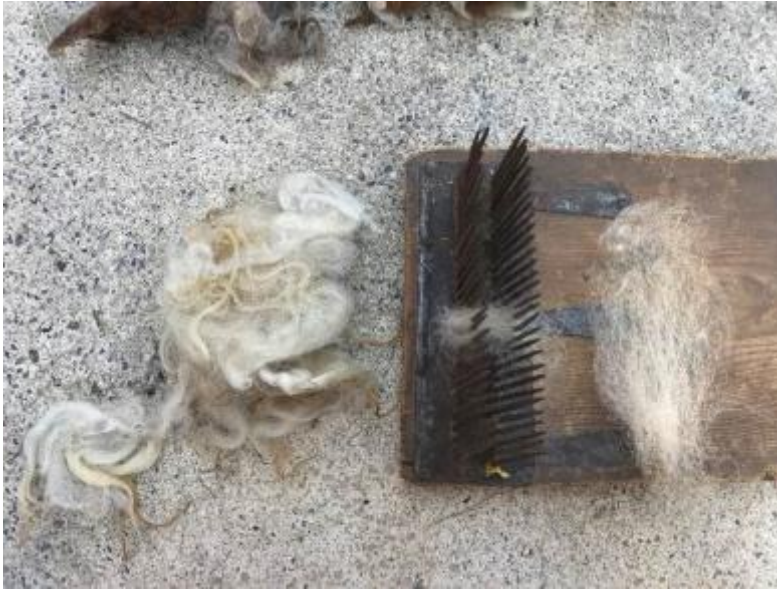
Figure 4: The ancient tool for roving and the wool before (left) and after (right) roving. Photography: Author, July, 2017.

as I had to follow the movement of the material in order to rove it. While roving, hands follow the shape of each individual fibre, in a way to put wool pieces in the order that their fibre structures are made to be (Figure 4). In doing this practice, there were times I could rove smoothly and times that I was tagging the wool, forcing it to come out from the needle structure. The more I force the material, the tighter I held the wool, and the worse it got. However, when the lead was assigned to the material, the movement became smoother.