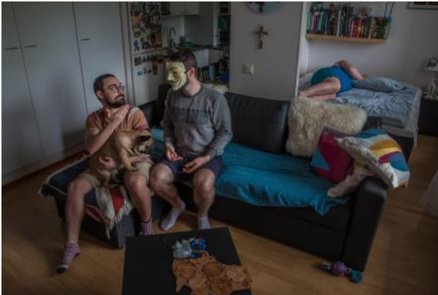
Figure 2. Photographs from hitchhiker's visits to domestic spaces: allotment and home.